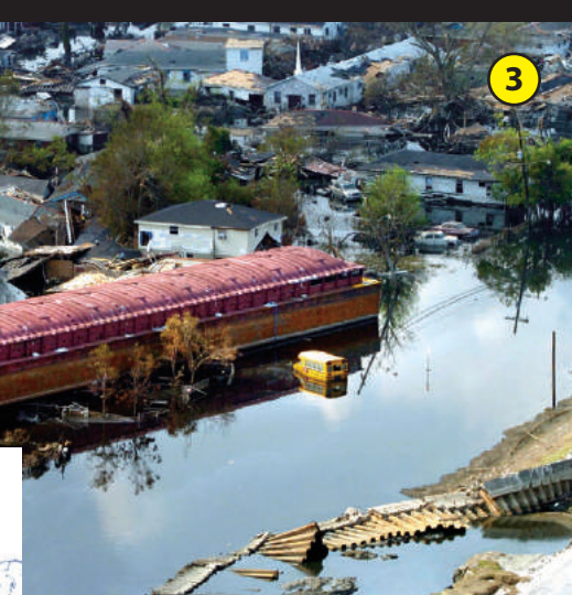
▲ Waters from a Industrial Canal break send a barge onto Jourdan Avenue