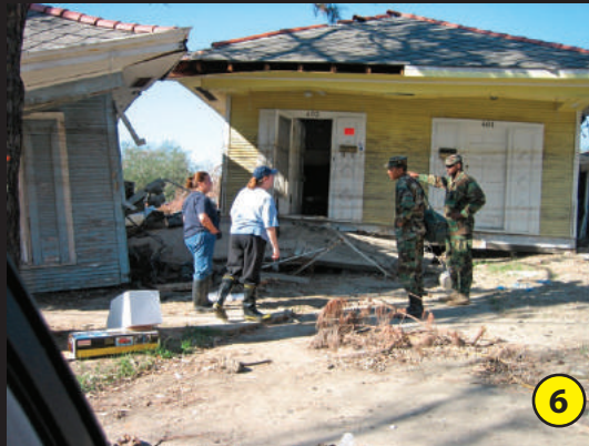
◀ National Guard troops and volunteers inspect damage from the 17th Street Canal breach