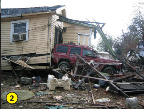
9th Ward Destruction