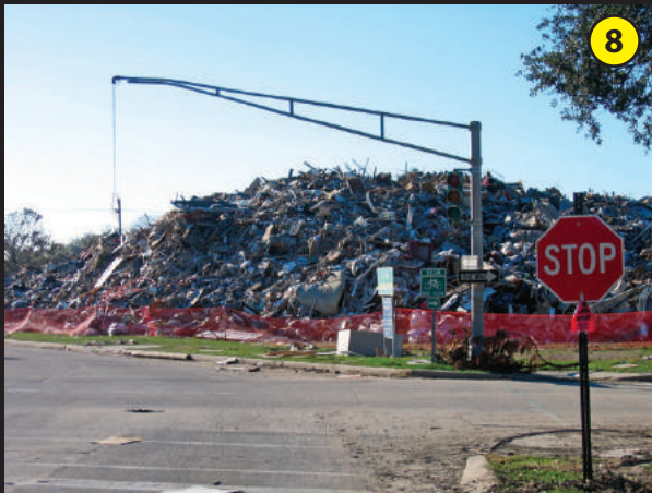
Storm debris fills the neutral ground along Pontchartrain Boulevard