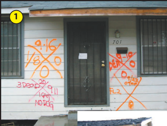
"3 Dead" at 701 Andry Street in the 9th Ward