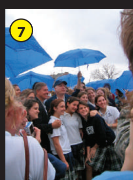
▲ Sen. John McCain addresses the media at the 17th Street Canal breach