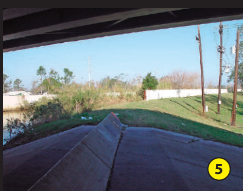
▲ Missing panels at the Orleans Canal